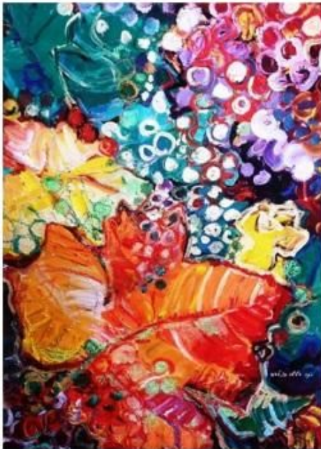
רנה בטיסו פיאדה

Our members Shoshi Rimer and Yemima Laban are participating in the following exhibition